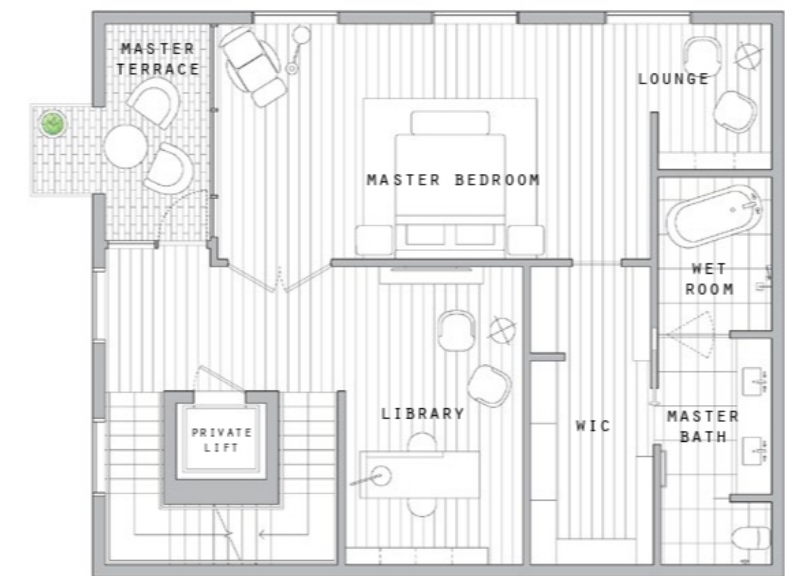
master bedroom level